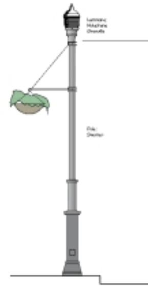
Downtown Standard (adapted from existing)