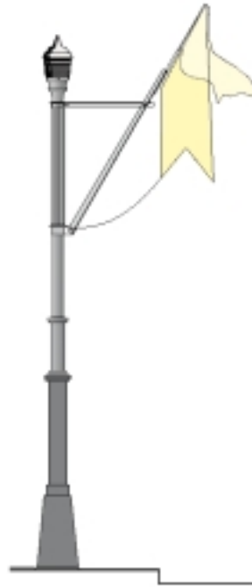
Downtown Standard 5th Avenue Version